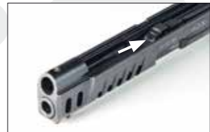
5.1.2 Fig. 1

Note: It is normal for the recoil guide rod assembly to flex when it is installed.