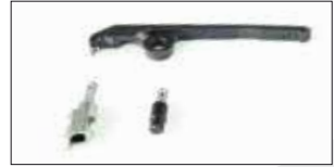
5.3.1 Fig. 2