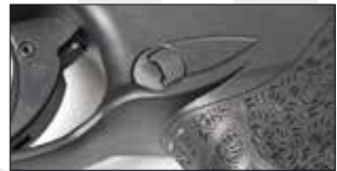
6.1 Fig. 8