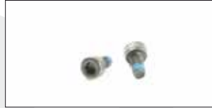
6.4.3 Fig. 2