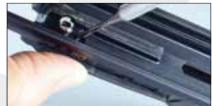
5.3.2 Fig. 2