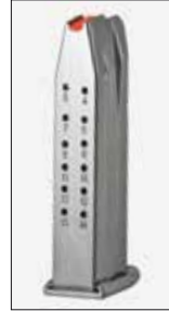
4.2.1 Fig. 1

When the magazine is removed from the magazine well in the grip, the number of rounds can be seen in the witness holes (4.2.1 Fig. 1).