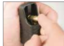
4.2.1 Fig. 5