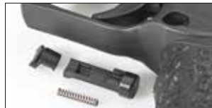
6.1 Fig. 4