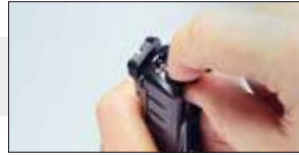
5.2.1 Fig. 2