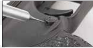
6.1 Fig. 1