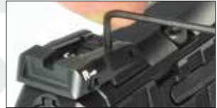
6.4.2 Fig. 3

In case of any after market rear sight to be installed, please follow the specific instructions provided with this rear sight.