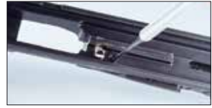
5.3.1 Fig. 1