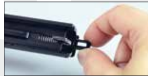
5.2.2 Fig. 1