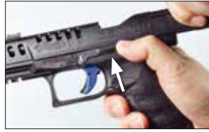
5.1.1 Fig. 3