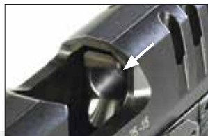
4.5 Fig. 4