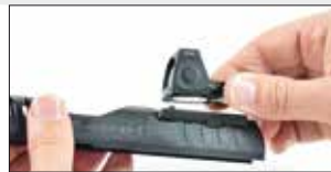
6.4.3 Fig. 4