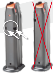
4.2 Fig. 1