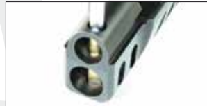
6.4.1 Fig. 1

The thread of the front sight screw should be secured using industrial adhesive (for example Loctite 648). To tighten the front sight screw, apply a torque of 8.8 inch pounds (1 Nm).