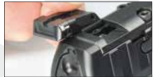
6.4.2 Fig. 4