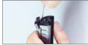
5.2.1 Fig. 1