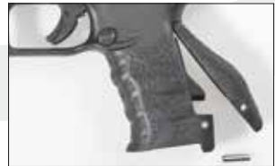
6.2 Fig. 1