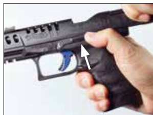
4.5 Fig. 3