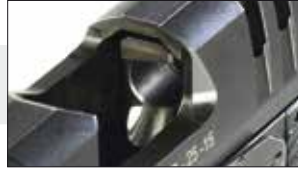
5.1.1 Fig. 3