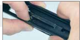
5.3.2 Fig. 3