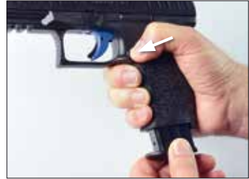
3.2.2 Fig. 1

Grasp the pistol with your finger off the trigger and outside the trigger guard. Depress the magazine release and remove the magazine (3.2.2 Fig. 1).