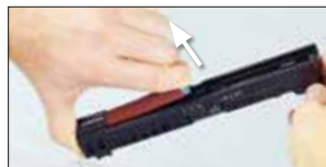
5.1.1 Fig. 6