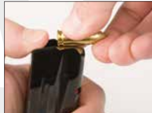
4.2.1 Fig. 2

Load the magazine by pressing a cartridge base (rear of cartridge) downward on the forward portion of the magazine follower (or downward on the case of a previously loaded cartridge) and sliding the cartridge fully under the lips of the magazine until the cartridge base is against the rear wall of the magazine. Repeat the procedure for the number of cartridges you wish to load, up to the magazine capacity (4.2.1 Fig. 2).