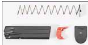
5.4.2 Fig. 1