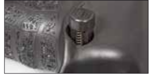
6.1 Fig. 6