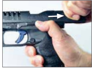
4.1 Fig. 2