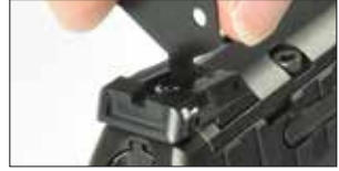
6.4.2 Fig. 2

Adjustment by one click moves the point of impact approximately 0.4" (10 mm) at a distance of 25 yards (25 m).