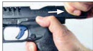
5.1.1 Fig. 2