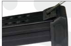
5.4.1 Fig. 2