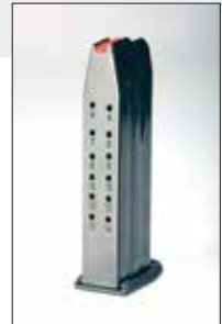
3.2.4 Fig. 1

“+2 Magazines” are available as an accessory item. They hold an additional 2 rounds and provide a downward extension to the pistol’s grip.