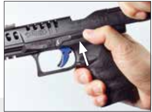
4.1 Fig. 3