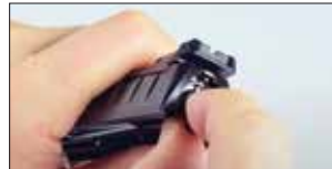
5.2.2 Fig. 2

Note: The striker interferes with the striker safety. If you want to remove the striker safety, first remove the striker assembly as described in section 5.2, and then continue with the extractor and the striker safety.