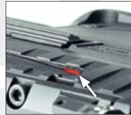
3.2.1 Fig. 1

The loaded chamber indicator is on the right side of the slide. The loaded chamber indicator can be observed when the rear of the extractor is recessed, revealing a red colored marking (3.2.1 Fig. 1).