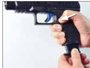
4.1 Fig. 1