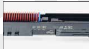
5.1.2 Fig. 2