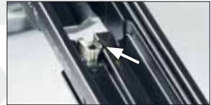
5.3.2 Fig. 1