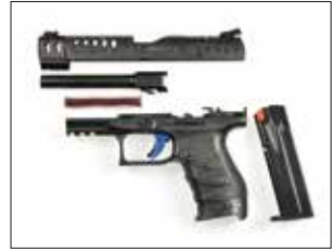
5.1.1 Fig. 7