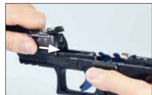
5.1.2 Fig. 3