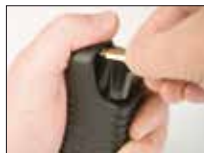
4.2.1 Fig. 4