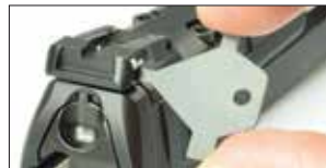
6.4.2 Fig. 1

If shots group to the left, turn the rear sight windage screw clockwise, if they group to the right, turn the windage screw counter clockwise. Use the smallest blade of the screw driver provided to do so (6.4.2 Fig. 1).