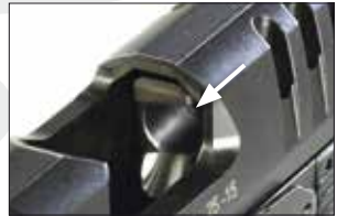
4.1 Fig. 4