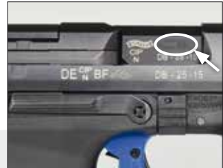
2 Fig. 1

Locate the cartridge designation marked on the handgun. This information indicates the ammunition that must be used in this firearm (see 2 Fig. 1). You are responsible for selecting ammunition that meets industry standards and is appropriate in type and caliber for this firearm.