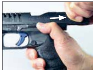
4.5 Fig. 2