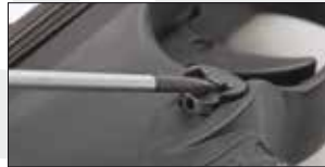
6.1 Fig. 3