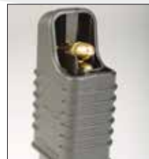
4.2.1 Fig. 3

Put the magazine loader with its long wall oriented to the rear on top of the magazine (4.2.1 Fig. 3). Press down the magazine loader and insert a cartridge with your other hand (4.2.1 Fig. 4). Let the magazine loader go up again. Push in the cartridge completely with your hand (4.2.1 Fig. 5). Repeat the procedure for the number of cartridges you wish to load, up to the magazine capacity.