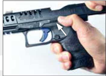
3.2.3 Fig. 1

Grasping the grip of the frame and with your finger off the trigger and outside the trigger guard, depress the magazine release, and completely remove the magazine. Firmly grasp the serrated sides of the slide from the rear with the thumb and fingers. While steadily holding the grip, briskly pull the slide fully rearward to extract any cartridge from the chamber and clear it from the pistol.