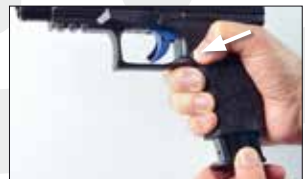
5.1.1 Fig. 1