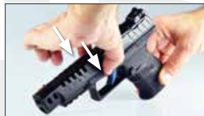
5.1.1 Fig. 5