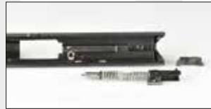
5.2.1 Fig. 3