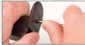
5.4.1 Fig. 1