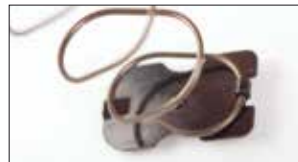
5.4.2 Fig. 2