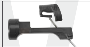
6.1 Fig. 2