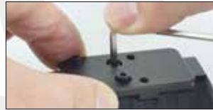
6.4.3 Fig. 3