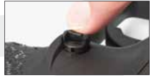
6.1 Fig. 7