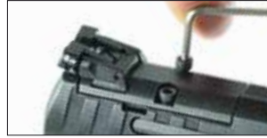
6.4.3 Fig. 1

Place the new mount base on top of the slide with the markings facing down. Keep pulling the mount base toward its front stop (toward muzzle end of the slide) while tightening the hex socket screws (6.4.3 Fig. 3). Tighten both hex screws (apply a torque of approximately 18 inch pounds (2 Nm)). Now install your after market sight following the instructions provided with it (6.4.3 Fig. 4).