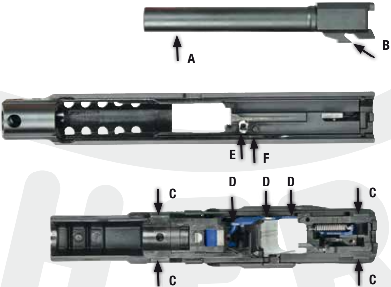
5.6 Fig. 1

⚠ CAUTION Do not lubricate inside the striker assembly, this creates the potential for residue build up and can inhibit the functionality of the firearm. The channel is designed to allow the striker to move freely without being obstructed by lubricants or buildup.