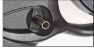
6.1 Fig. 5

To attach a lanyard, push the pin in the bottom part of the backstrap out using a 5/32'' (4 mm) punch, insert the lanyard, then replace the pin.