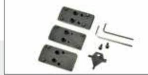
6.4 Fig. 1